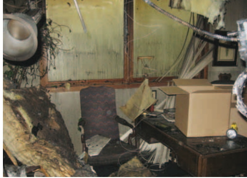
Physician's office prior to renovations.