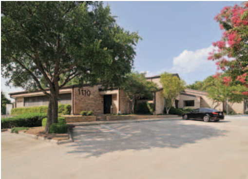
The post-renovation exterior features disabled accessibility.