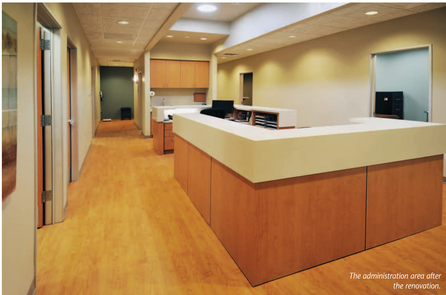
The administration area after the renovation.