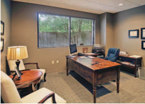
Physician's office after renovations.