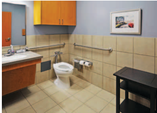
The newly-renovated restroom also features disabled access.